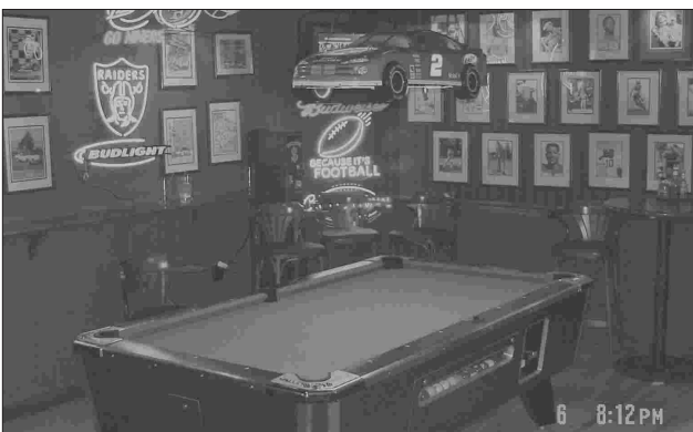
Minnesota Fats has Left the Building

You can view selected photos taken at our conference this year. These are posted on the NCFIA web site at www.NCFIA.org . Once there, access the conference tab and look under highlights. ■