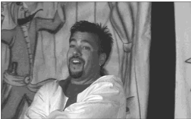
Don't Try This at Home!