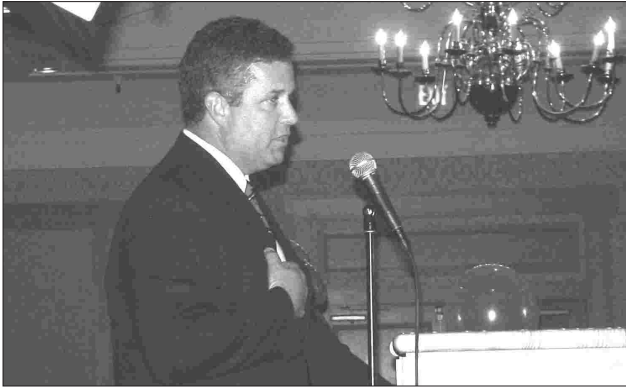
El Presidente !!!!