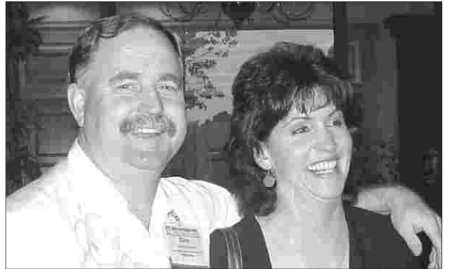
Our Intrepid Photographer Dan Stroski